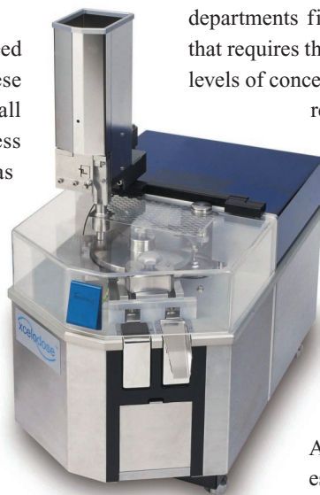
Figure 3: Xcelodose™ 600 System

There are several other ways to increase speed and flexibility of drug development. These include miniaturisation – scaling down all aspects of the formulation and process development by using techniques such as granulation (for example, small-scale high-shear equipment); compaction simulation or flow assessment by a combination of small-scale equipment and experimental design. One such example is use of the Bench Top FT4™ Powder Rheometer to assess flow performance of powder blends. This non-destructive test uses 10-20g of blend to determine likely flow behaviour. The material studied can subsequently be evaluated for compression and post compression behaviour.